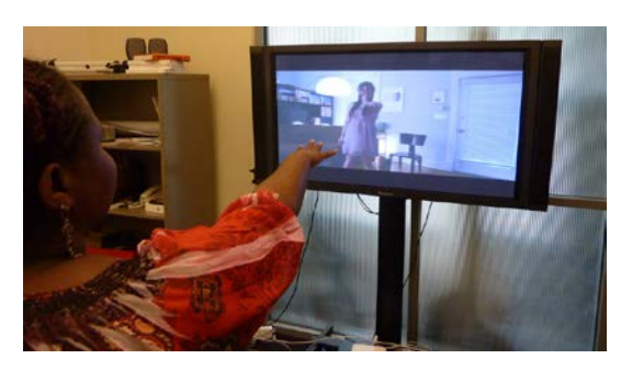
Figure 1: Take Hand Interaction

they would affect the narrative when performed. The possible scenarios that we designed started with three basic premises: